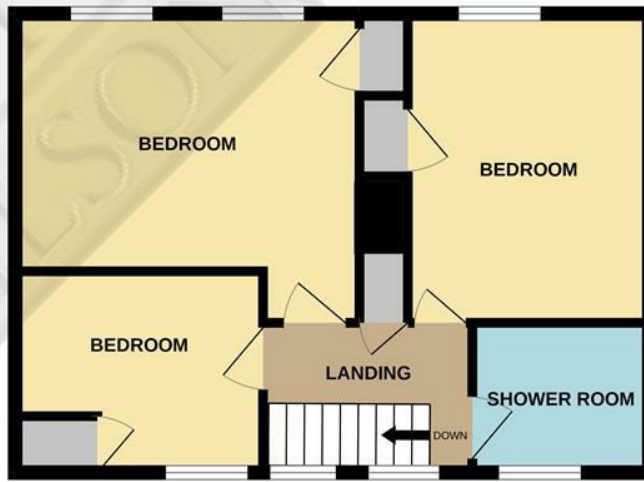
1ST FLOOR 466 sq.ft. (43.3 sq.m.) approx.

TOTAL FLOOR AREA : 1266 sq.ft. (117.6 sq.m.) approx.