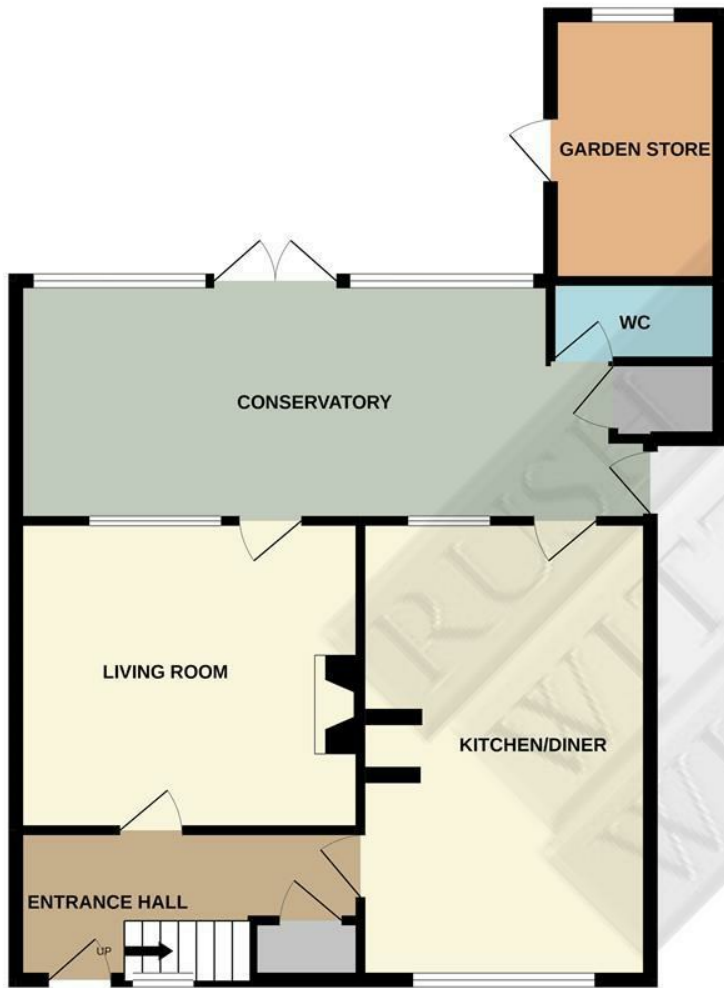
GROUND FLOOR 800 sq.ft. (74.3 sq.m.) approx.